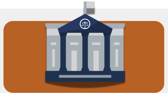
Court & Court Systems

Law enforcement issues traffic citation to driver.