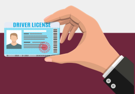
State Drivers License Agency